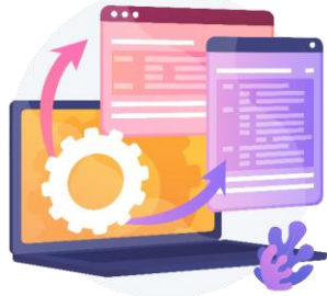
Dashboard & Reporting