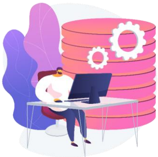
Database Apps Library Management System